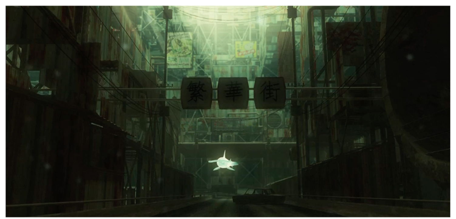
Ann Grim "Beyond The Unknown" 2017

In recent years we have seen an intense and speedy cultural migration and merging of art, architecture and moving image. As empires are built on ruins, so has digital mass evolving from the fractured analogue spectrum of our not so distant past, submerged itself into the fluid fabric of our contemporary worldview.